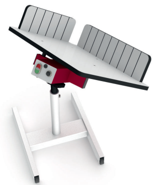
PR 43 S